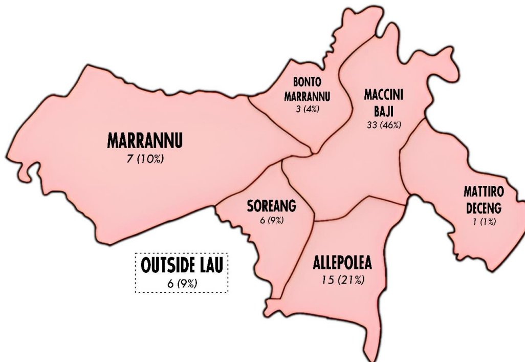
Figure 1. Geographic Distribution of TB Cases in Lau Primary Healthcare