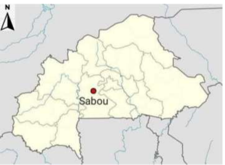
Figure 1. The geographical location of the study area in Burkina Faso

The study was conducted from October 2021 to January 2022 in the rural Commune of Sabou, located about 80 km from Ouagadougou in the administrative region of Centre-Ouest (Figure 1). According to a previous study, pet vaccination and community awareness campaigns are often organized by the animal health authorities of the region (Savadogo et al., 2022). The study was initiated in the context of a goat rabies outbreak management (Savadogo et al., 2023), and was composed of the following steps. The first phase corresponded to a goat rabies outbreak investigation (i.e laboratory confirmation, field joint investigation). The second phase was a household survey conducted to assess the knowledge, attitudes, and practices regarding rabies and prevention measures in the community.