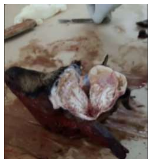
Figure 2. Collection of brain sample from the suspected rabid goat

ed out by an owner about a sick goat. Reportedly, the observed clinical signs included aggressivity, bleating with severe tones, biting of the accessible parts of the body, and pronounced pica. This sick goat died on 16 October 2021 (5 days later). However, the animal health officer reported that due to technical issues, no brain sample was collected for laboratory confirmation of rabies. A day later, the veterinary office was contacted about a second goat presenting similar clinical signs. Suspecting rabies, the local animal officer who was familiar with Rabies Free Burkina Faso informed the association requesting support to investigate the case. Thus, the owner was approached and the goat was acquired. Subsequently, the goat was put under veterinary observation in the same veterinary office and reportedly died on 20 October 2021. A Fluorescent Antibody Test performed on a brain sample confirmed rabies infection in the goat (Figure 2 and Figure 3). During the joint investigation initiated, recommendations that emerged from discussions with stakeholders were related to the need to identify gaps in the knowledge of rabies among communities, and organize awareness activities for community members such as conducting regular mass dog rabies vaccination campaigns.